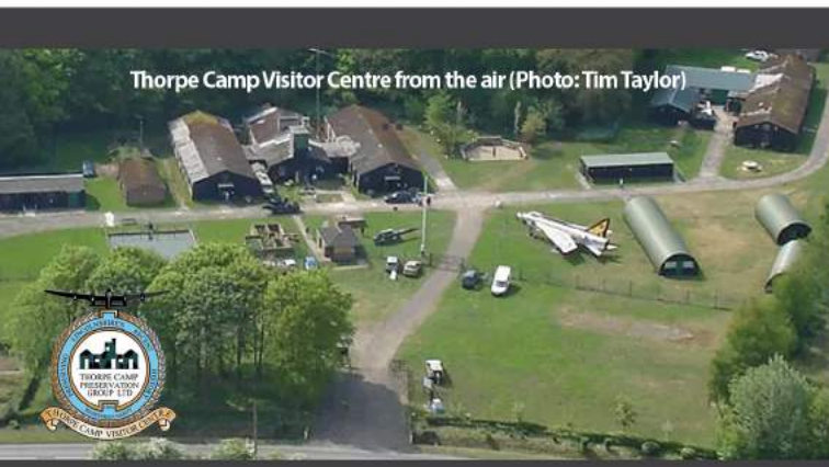
Thorpe Camp Visitor Centre from the air

Reg no.08729269 - Registered Charity No. 11544931